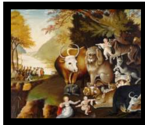
The Peaceable Kingdom Painting by Edward Hicks