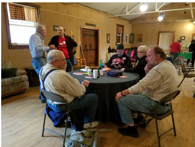
From the Alpha Retreat