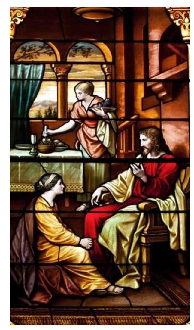
July 21, 2019